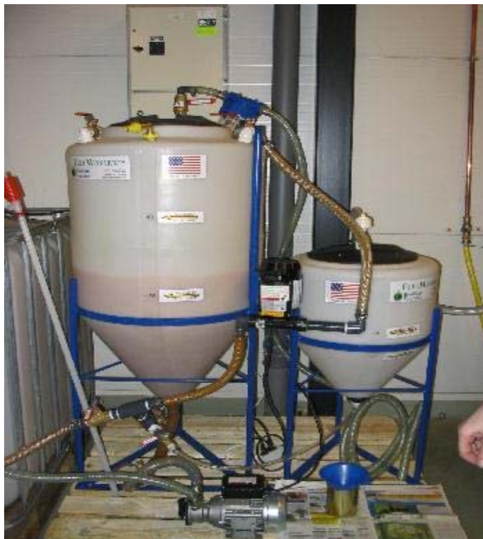
A simple biodiesel manufacturing facility that can be located in any small space

The next stage of costs are the harvesting labour and capital costs, working capital, processing the seed into oil and seedcake, processing oil to Biodiesel and seedcake